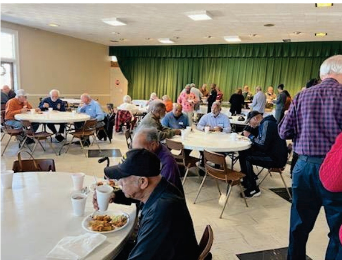
Retiree Luncheon attendees.