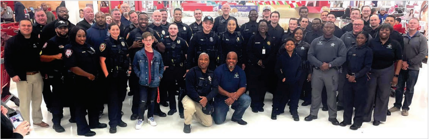
Law enforcement participants from Durham PD, Durham SO, NC Central University PD, and University of NC Hospital PD.