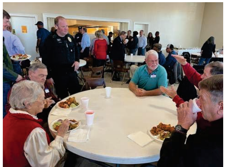
Retiree Luncheon attendees.