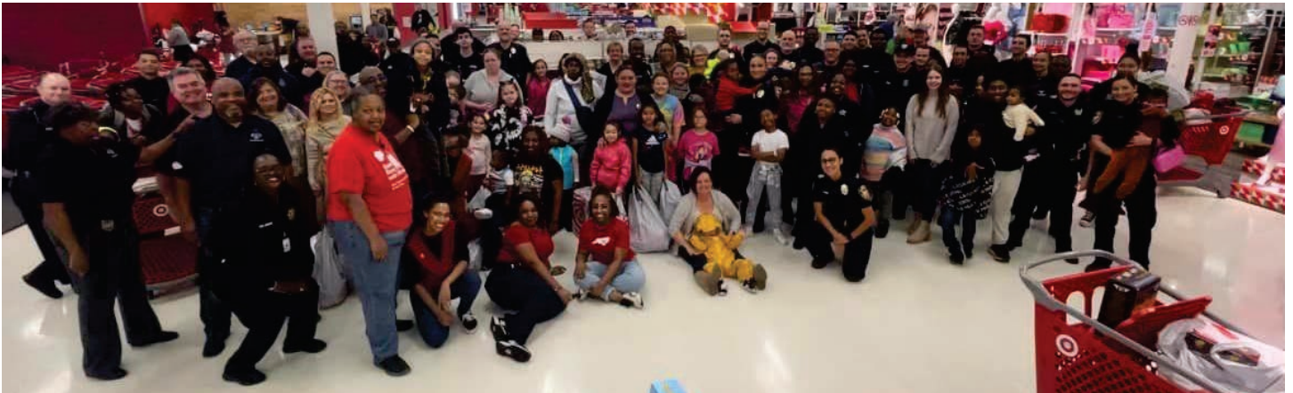
Families and law enforcement participants.